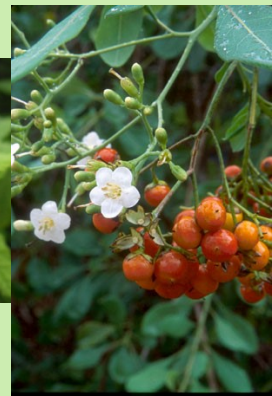
Bahama Strongbark, Bourreria succulenta . Shows its Fruit for birds.

The Fulvous Hairstreak. Electrostrymon angelia , is also known as the Angelic Hairstreak. It took up residence in Florida in the early 1970s with others including the Silver-banded hairstreak, Gray Ministreak, Bahaman Swallowtail, Malachite, Dorantes Longtail, Tropical Buckeye and the Dingy Purplewing according to R.Cech of "Butterflies of the East Coast".