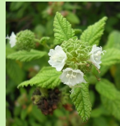
Bloodberry, Cordia Globosa .