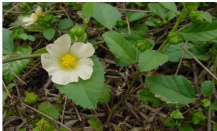
Common Fanpetal, Wireweed, Broomweed. Sida acuta.

Directions to 3245 College Ave, Davie. From the south , I-595 West, Take exit 7. Merge into FL 84, turn on Davie Rd. Turn right onto Nova Dr. Turn left onto College Ave. Destination is on your right. It is the first building on your right. From the north , I-95 south to SW10th St. to the 869 Sawgrass Expressway (toll). After the Sunrise Blvd exit, merge onto I-595 East to Ft. Lauderdale. Take the University Dr. Exit, turn right onto University Dr. Stay in the left lane. At the 2nd light turn left onto Nova Dr. At the first light turn right onto College Ave. Destination is on your right. It is the first building on your right facing College Ave. The one story bldg. is opposite FAU campus, Davie. UF/IFAS are located behind the building.